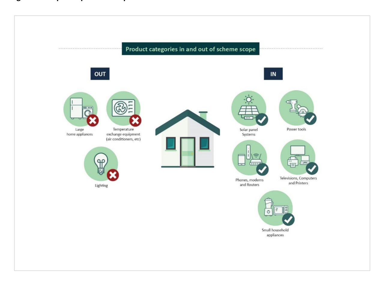
Figure 1: Proposed product scope

The proposed scope of SEEE has been designed to: