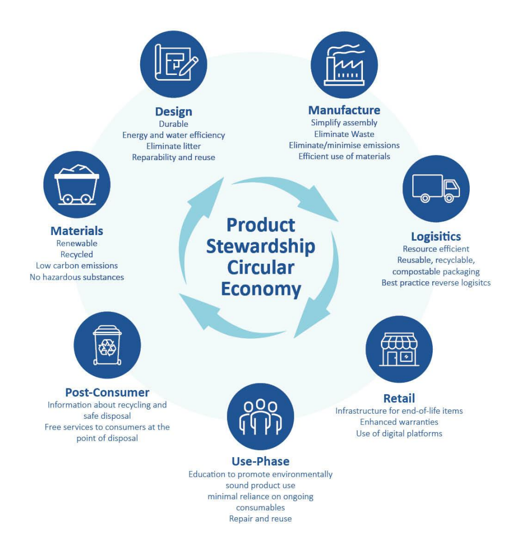
Diagram 1: Product stewardship circular economy model

It is anticipated that any national e-stewardship regulation would support state and territory e-waste landfill bans. However, the proposed regulation is not intended to be the sole mechanism to support these bans. As such, if government decides to implement the scheme proposed in this paper, the department will work with state and territory government agencies to identify related areas of state and territory regulation that could support efficient implementation of the proposed scheme.